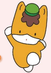
Gunma's mascot, Gunma-chan