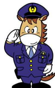
Mascot "Joshu kun"

※ There are some guidance sections in each municipality.